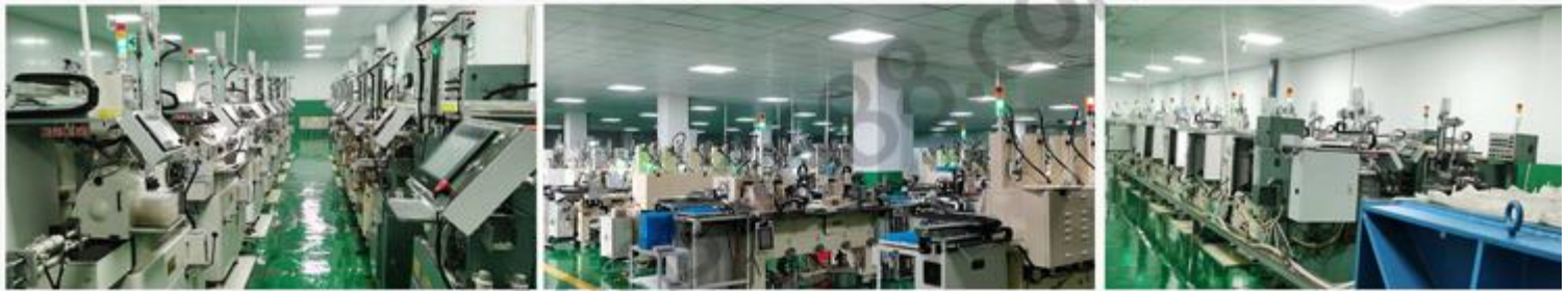
Glass lens processing equipment