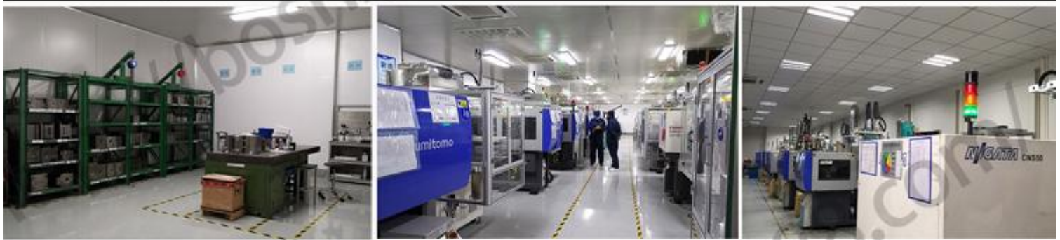
Plastic lens processing equipment