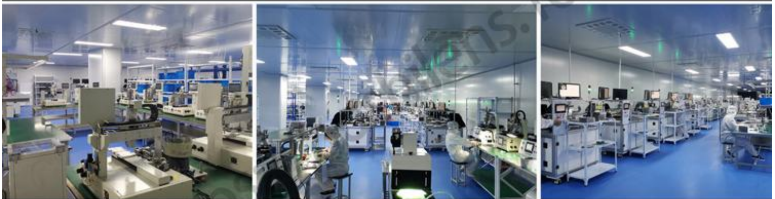
Assembly of testing equipment